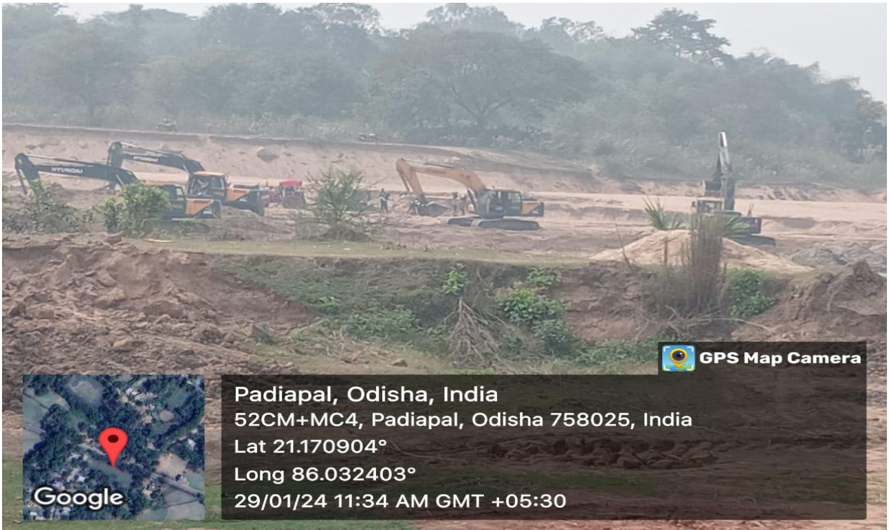
Table 6 FOUR MACHINE ENGAGED FOR ILLEGAL SAND MINING WHEN MACHINE IS PROHIBITED FOR SAND MINING