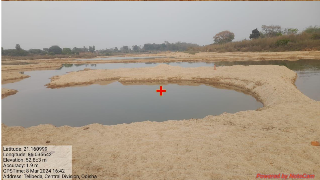
Table 5 DEEP MINING RESULTING POND STRUCTURE