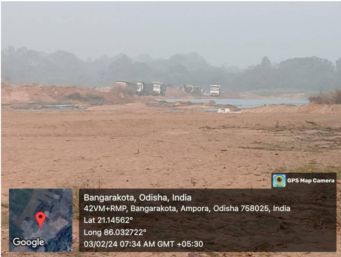
Table 3 ILLEGAL MINING IN BANGARKOTA MOUZA