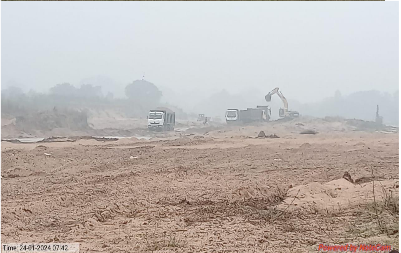
Table 8 PHOTOGRAPH OF ILLEGAL MINING DATED 24TH JAN2024