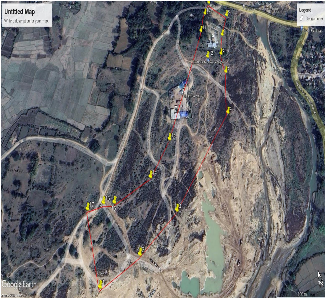
Table 7 GOOGLE EARTH IMAGE SUGGEST THE LEASED ARE IS HAVING SOME STRUCTURES FOR DAIRY FARM AND KOSHALESWARTEMPLE LAND AND MINING BEYOND LEASEA AREA. ALSO IT SUUGGEST CLOSE TO RIVER BRIDGE