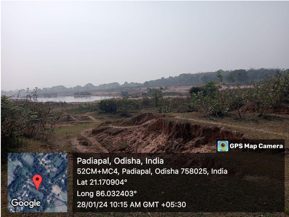
Table 2 RIVER BANK ERROSION