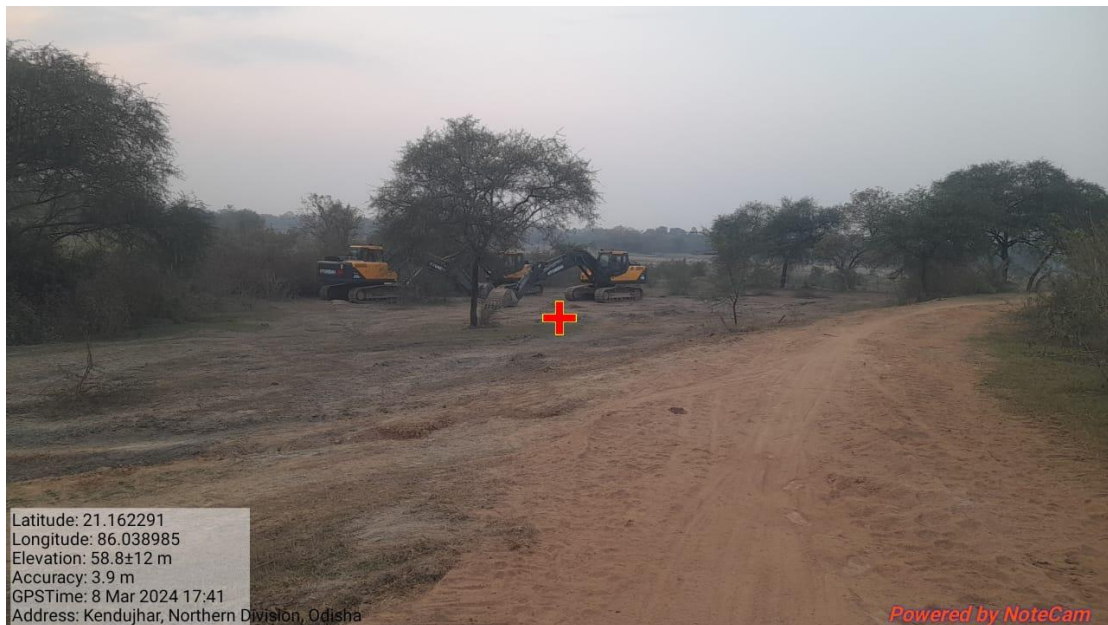
Table 1 THE MACHINES PARKED NEAR KUSHEI RIVER AT KOCHANANDI MOUZA SUGGESTING MINING OPERATION DURING NIGHT

PHOTOGRAPHS DATED 8 TH MARCH 2024 SUGGESTING PERPETUATION OF ILLEGAL MINING DURING NIGHT AND PARKING OF MACHINES WHICH WERE USED IN MINING DURING NIGHT, HEAPS OF SAND GATHERED AFTER MINING, POND LIKE STRUCTURE SUGGESTING DEEP MINING AND IMPRESSION OF TYRES OF VEHICLES USED FOR MINING AND TRANSPORTATION AT KOCHAINANDI MOUZA AND TELIBEDHA MOUZA