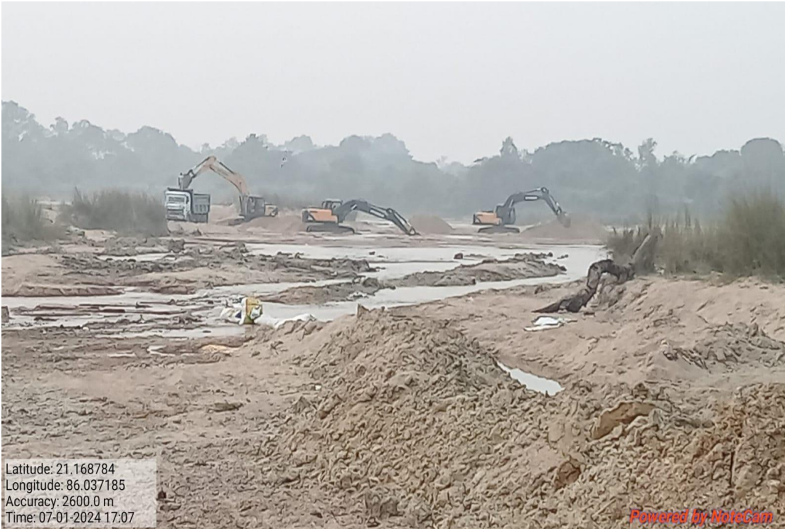
Table 1 THREE MACHINES USED FOR ILLEGAL SAND MINING BY LESSEE ON 7/01/2024