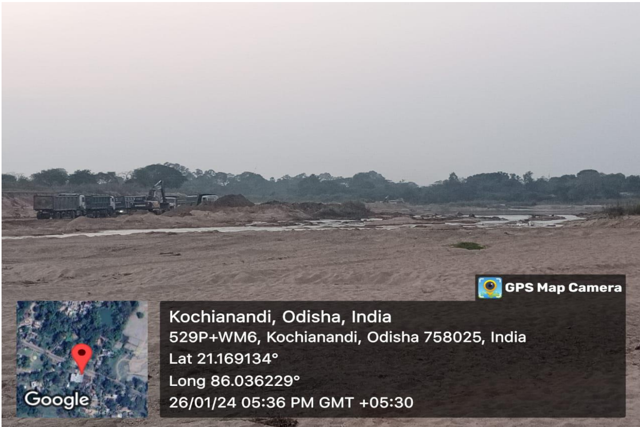
Table 5 MINING AT KOCHIANANDI BEYOND LEASE AREA