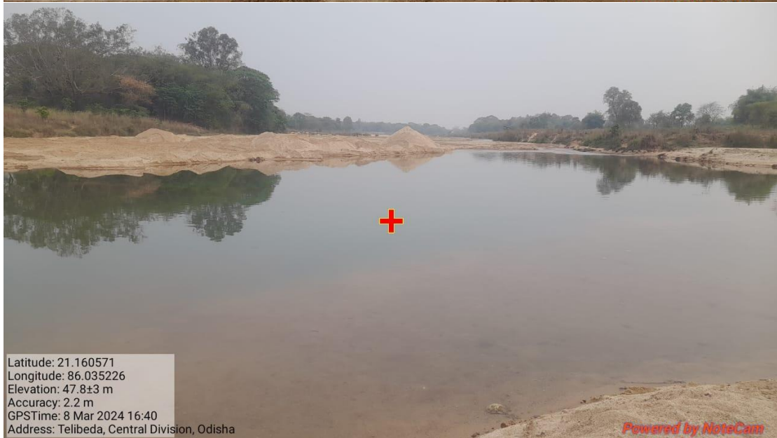
Table 6 HEAPS OF SAND GATHERED AFTER MINING