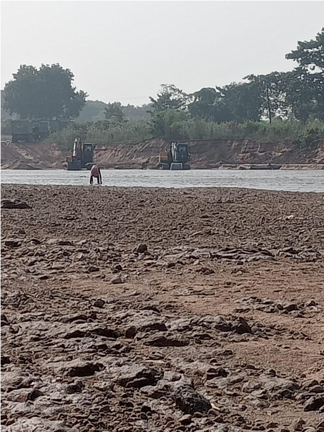
Table 4 MINING DAMAGING THE RIVER BANK